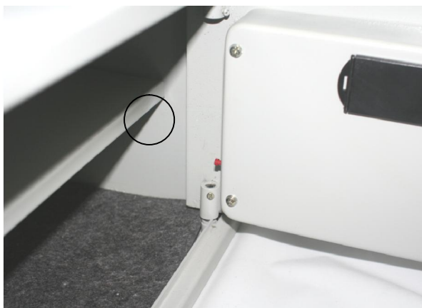
The red button

In case code get lost, or battery used down, For EA and EH safe, remove the center cover of the keypad, you will find a tubular lock, use the override key to open the safe. For ES safe, remove the small logo, unscrew the screw there, take off the small cover that holds the keypad, you will find a lock to open the safe. Please don't keep this key in this safe. The safe serial number is stick near the override lock, factory can copy this key by this number if it get lost.